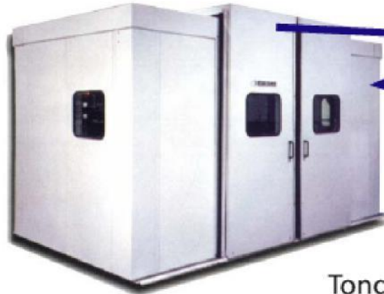
Tongue & Groove