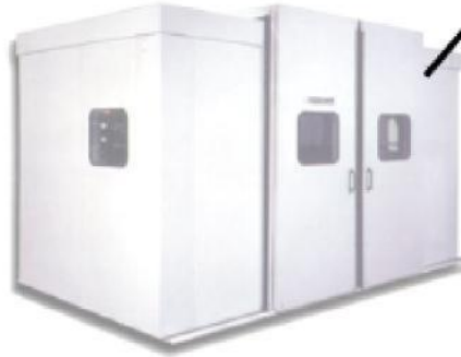
Quick Removable Panels