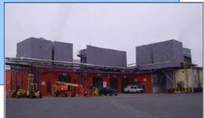
Curtain Enclosures and Barrier Walls