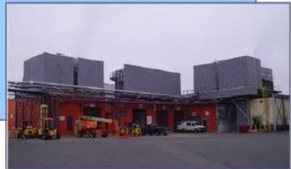
Curtain Enclosures and Barrier Walls