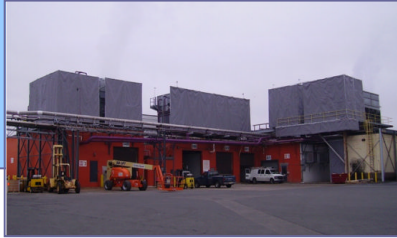
Curtain Enclosures and Barrier Walls