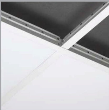
ArtEx Ceiling Tiles