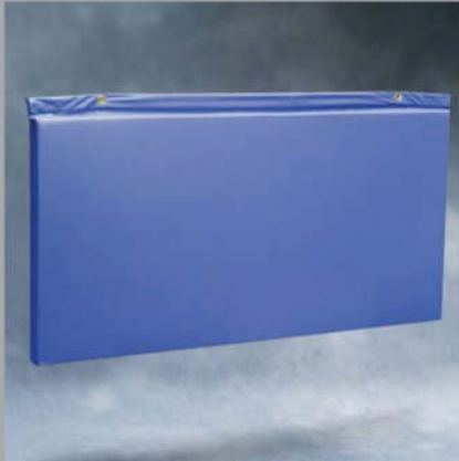
ArtEx Clean Baffles